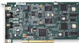
Cantata TruFax® (190mm x 107mm)