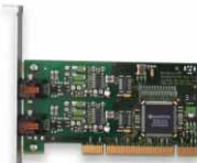
RockForce IQ™ (120mm x 64mm)