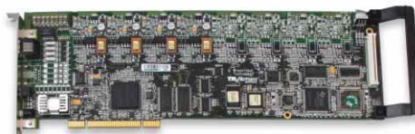
Cantata TR1034® (315mm x 107mm)

PCI 3.0 Plug and Play compliance ensures that there are no switches or jumpers to set. The board simply installs with the operating system's standard procedures and installation wizards. Universal PCI support enables use with 3.3V/5V, 32/64Bit, 33/66Mhz, and PCI/PCI-X system slots, ensuring compatibility with any system.